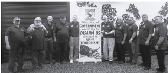
Erie county chapter officers and members at the September 17th banquet.