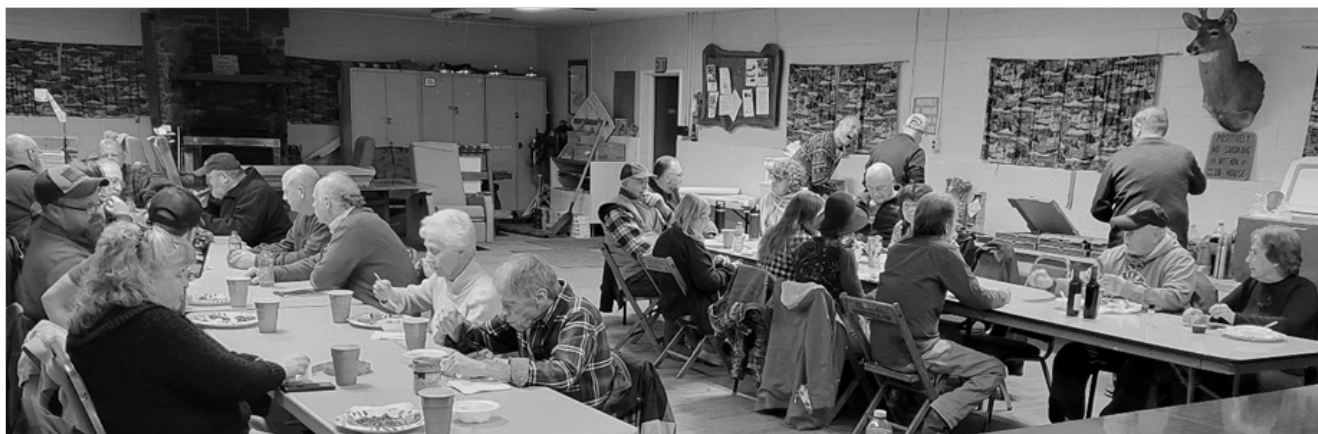
Held their Christmas Party on December 18 th at the Watertown Sportsmen Club.

There was also a discussion about other 2A Organizations, including their meeting times and dates for anyone interested in attending. We have to all work together and try to make an impact, with the 2024 elections coming up.