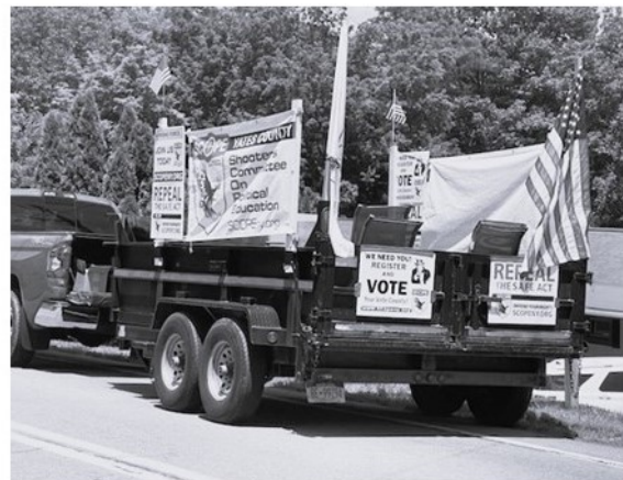
Yates County; 4th of July Branchport Parade float. Pocket Constitutions were handed out to the crowd.

voice heard. We educate voters, donate money to different organizations such as G.O.A., Second Amendment Foundation and others to help fund lawsuits. By attending meetings on a regular basis, you have the benefit of staying abreast of the issues. This is also a great way to educate your friends about issues the mainstream press won't report. Be involved; it takes a team of individuals with many different talents to accomplish what this 2A organization is all about...whether it's manning a booth, planning an event, researching / collecting raffle items, researching legislation, keeping records or so many other important parts of the machinery.